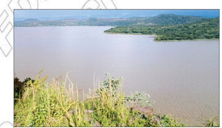
(Adapted from the Beauty of Ethiopia, 1997)

Lake Langano is set against the blue-grey backdrop of the Aris mountains. It is 215 kilometres away from the capital city, Addis Ababa. Langano provides an ideal place for sun bathing, water sports, fresh water cool breezes and fine accommodation .