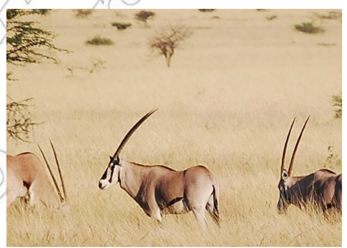
Adapted from the Beauty of Ethiopia, 1997

The 1,800 metres high semi dormant Fantalle volcano is an extensive area of pools of mineral hot - springs fringed with doum palms, and the extraordinary