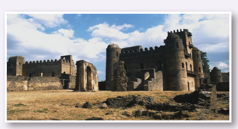
Castles of Gondar