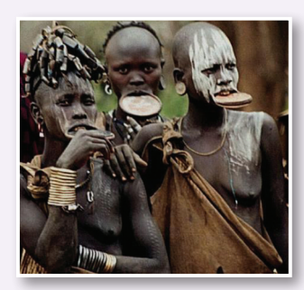
The Jinka-Mursi people