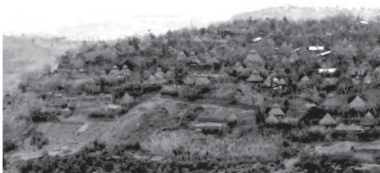
The Konso settlements