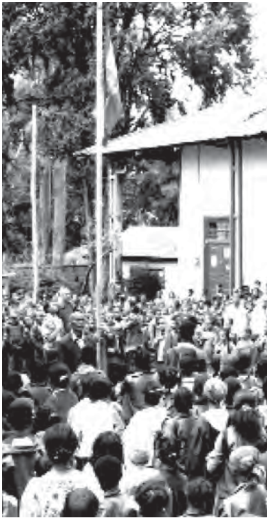
Students on flag raising ceremony at school

related to your personal responsibilities. One who fulfills his/her personal responsibilities should have no problem accomplishing his/her group responsibilities.