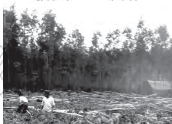
Deforestation in Ethiopia

When we do not use our resources properly, it makes life difficult. We have to preserve our forests. We have to replant them when we cut them down. Ethiopia suffers from repeated drought and famine because the forests have been destroyed. One of our responsibilities is to protect