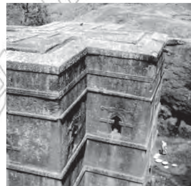
Monolithic Rock churches of Lalibella