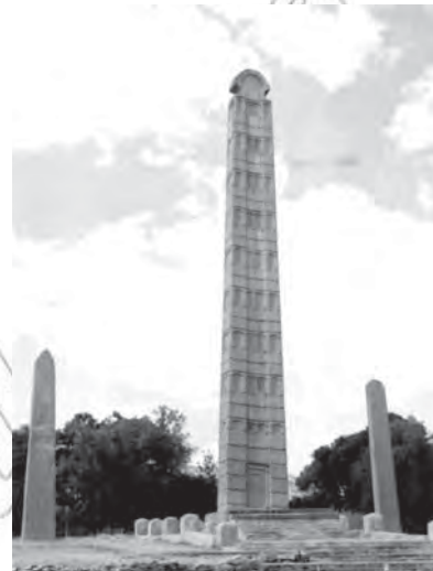
Monuments of Axum

Tourism helps to develop the handicrafts industry. Many visitors buy wood carvings which symbolize the monuments of Ethiopia or other art works. People engaged in woodwork, painting and stone carving sell their crafts to tourists and make a living. In Ethiopia, tourism is a good source of income for those who develop such skills.