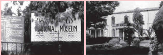
The National Museum in Addis Ababa

future generations. So the stolen artefact had to be returned.