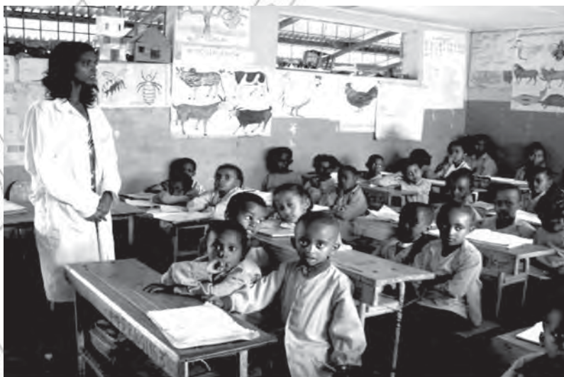
A teacher responsible for her class

Moral principles are also source of responsibilities. In societies, there are behaviours which are considered as good or bad, right or wrong. For example, honesty and truthfulness are accepted as good behaviour . Telling lies is bad behaviour. As a student you know you must not copy exam answers from other students. This is dishonest behaviour .