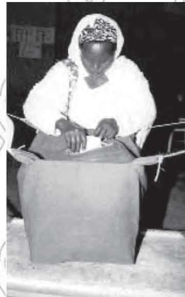
Person voting in a democratic election

of person are part of human rights. The rights of thought, opinion and expression are part of political rights. Without such rights no democratic system can exist. As a citizen of Ethiopia, you have these rights to enjoy.