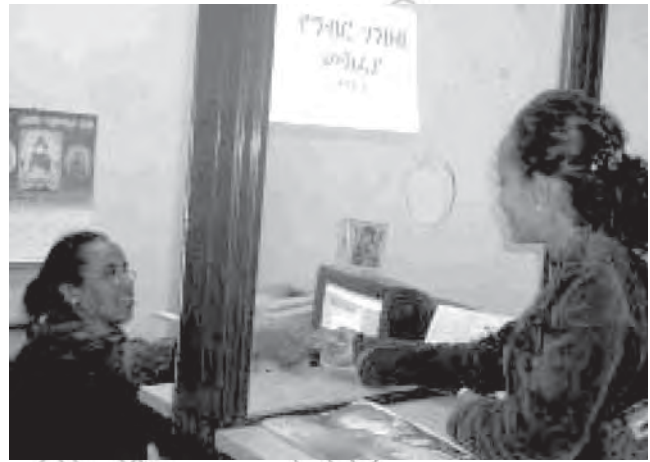
Tax payer fulfilling obligations