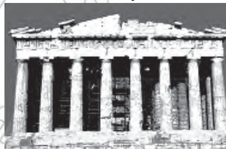
The Parthenon: One of the Seven Wonders of the World