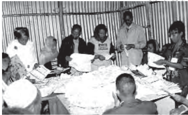
Counting votes after an election

Form small groups. Each group should pick one characteristic of a democratic system to discuss. The group representatives should present their ideas to the class.