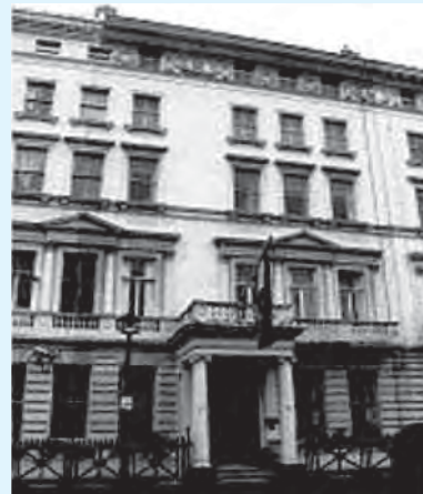
Ethiopian Embassy in London, UK

Diplomatic mission refers to a foreign body which is set up by mutual agreement of states to deal with foreign relations. The objective is to maintain constant official contacts and to act on all political and other questions arising from the interrelationship of states. Diplomatic missions could be for state to state relations and state's relations with regional and international organizations.