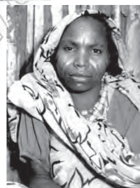
Different Cultures of Ethiopia