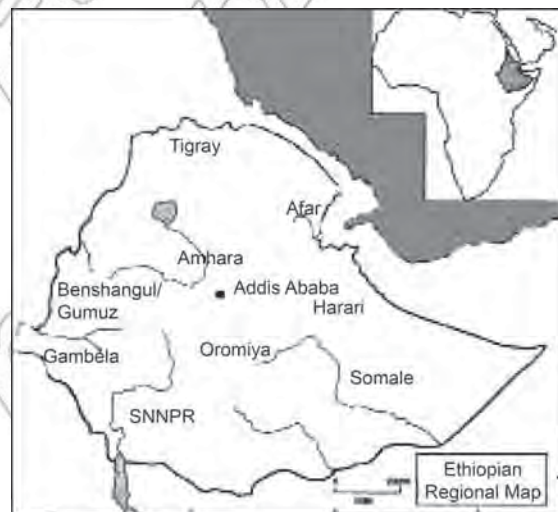
Map of Ethiopia

? Copy this map into your exercise book. Draw the boundaries of each regional state.