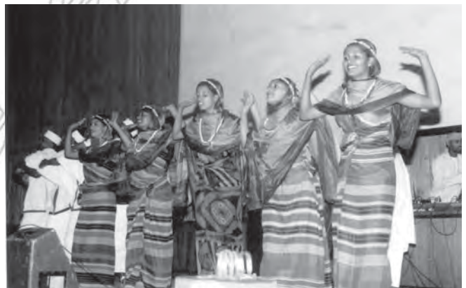
Cultural dances of Ethiopia