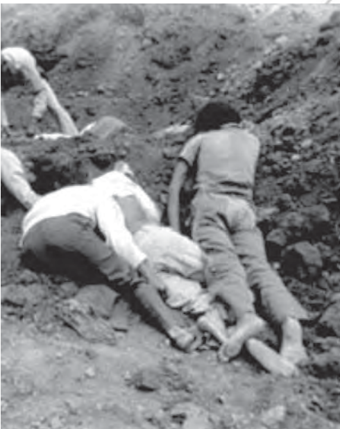
Victims of the Red Terror

When Haile Selassie was replaced by the Derg, the military dictators continued to exercise unlimited power in a different form. The Derg used military force to stay in power. So, the source of its power was the army not the people. During the Derg, people were killed and their rights were badly abused. It was a period of rule by fear. The Derg issued a constitution in 1987 to strengthen its power to rule with the single party it had established. There was no freedom of expression and association. There was no rule of law. So, people were not allowed to form political parties. Both governments exercised unlimited power over the people. Thus, the Ethiopians faced extreme repression under the two governments.