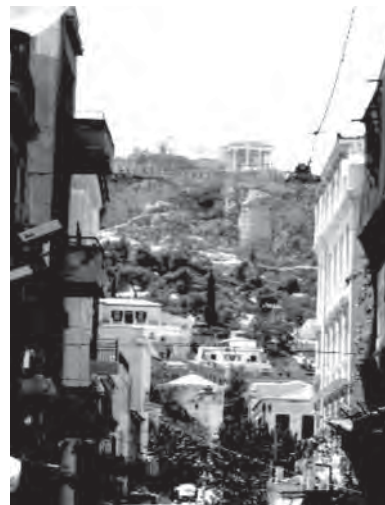
Athens gave the world Socrates, Plato and Aristotle, systematic mathematics, the Olympics and, above all, democracy