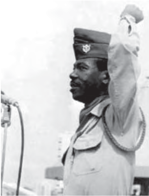
Col. Mengistu Haile Mariam