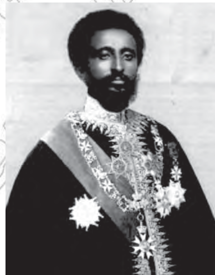
The last emperor of Ethiopia — Haile Selassie I

amended it in 1955. These constitutions stated that his power was absolute, therefore, unlimited. Nothing was more important than the Emperor himself, even the country.