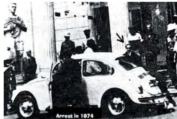
The arrest of Haile Selassie I