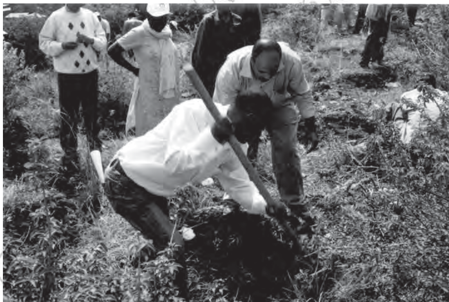
Citizens involved in community participation