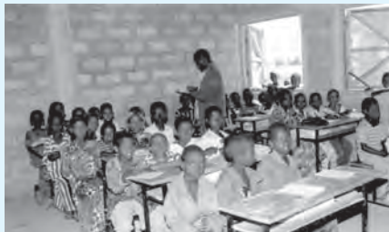
Children from different ethnic groups at school