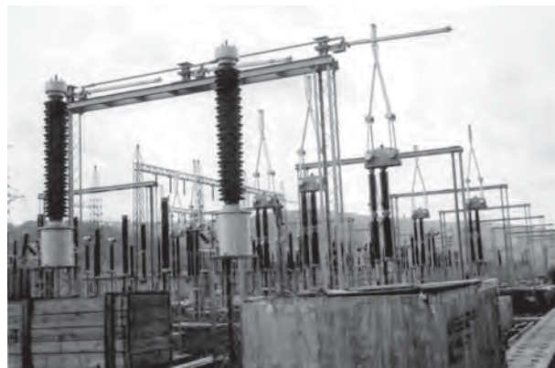
Hydro-electric power built in co-operation with the EU