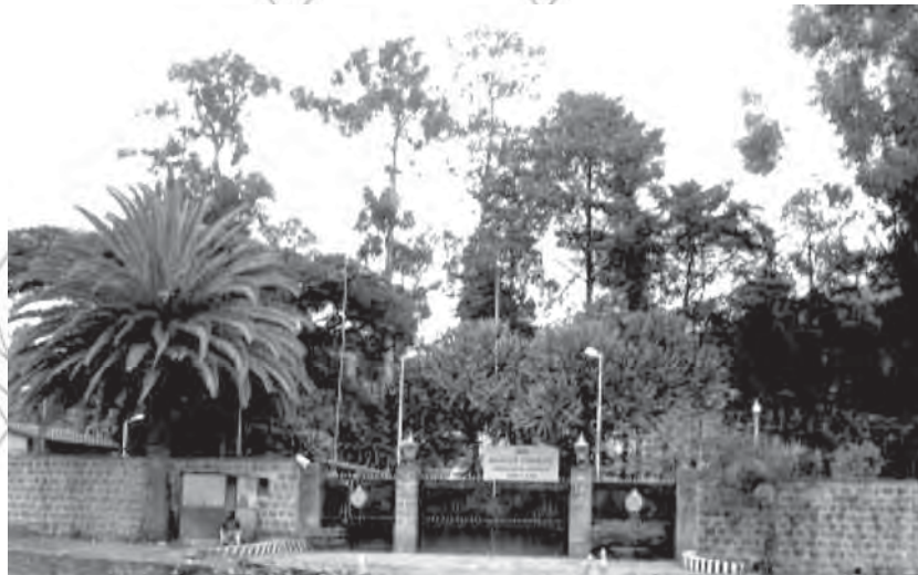
British Embassy entrance in Addis Ababa