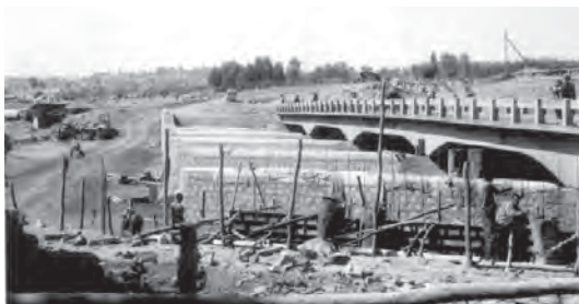
Road built as a result of co-operation with other countries