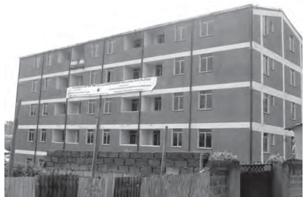
You may want to lease a new apartment in a city

since GDP represents the total value of production of goods and services. This means, the more goods and services we produce, the more we are likely to consume and save. Therefore, as far as saving is concerned, the most important thing for a country to consider is its national income.