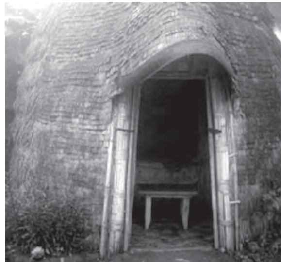
A rural Ethiopian household