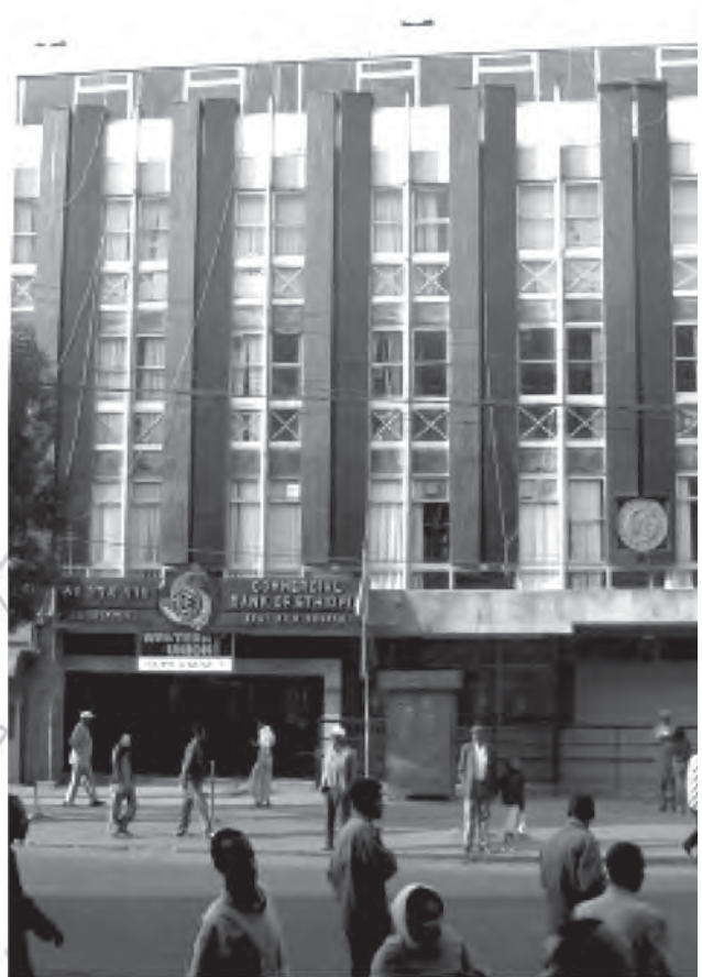
Banks are modern institutions of saving

Choose 5 items that are produced in this country. Explore the prices and the quality of those items and try to compare them with similar items that are imported.