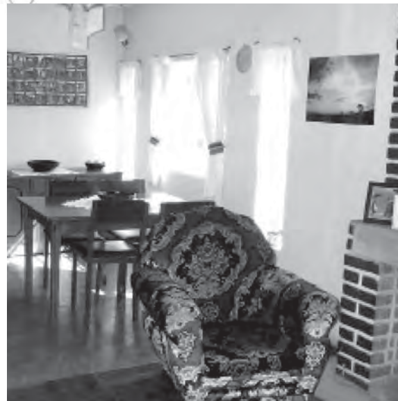
A modern urban Ethiopian household