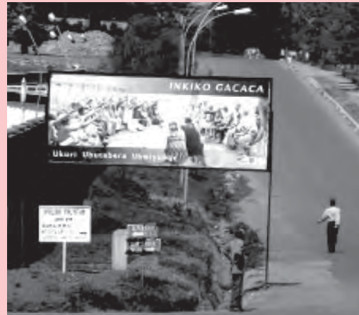
Gacaca — local community courts try those involved in genocide atrocities

The conflict culminated in genocide in 1994 after the assassination of Rwandan President Habyalimana and the President of Burundi, Cyprien Ntaryamira, while flying to Rwanda. Hutu extremists started killing the Tutsi and moderate Hutus on April 6, 1994 and the killing continued for a hundred days. About 10,000 Tutsis were killed every day. The Hutu militia killed up to 800,000 Tutsis and moderate Hutus within a hundred days using everything including machetes. Finally, the Tutsi rebel movement, led by Paul Kagame, managed to stop the genocide in July 1994 by defeating the Hutu forces.