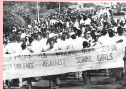
Students taking part in a protest

the two groups and some students were injured as a result of the conflict.