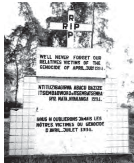
Memorial to Rwanda's genocide victims

Genocide is another threat to peace and security in the world. Genocide is a systematic killing of all