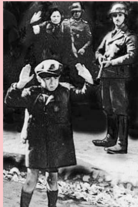
The horrors of the Holocaust