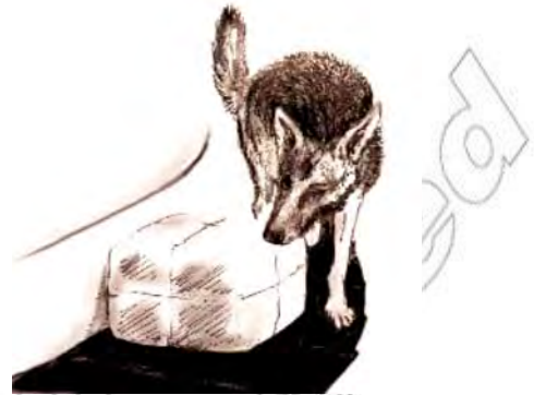
Sniffer dog seeking out drugs

Drug use and trafficking are threats to national and global security since they are closely related to crime and violence. Drugs are related to crime and violence in many ways. In general, drug users involve drug-related crimes and offences such as robbery and theft to get money to support their drug habit. They also are involved in illegal drugs' markets and may commit offences including homicide and sexual assault.