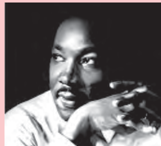
Martin Luther King Junior

US citizens who stood up for their rights