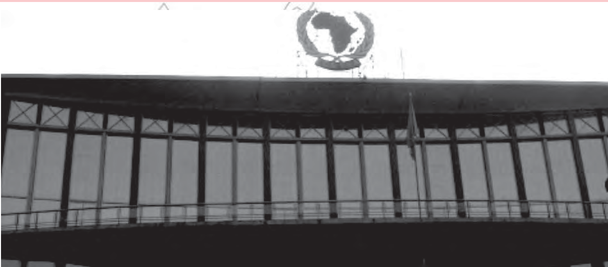
The Economic Commission for Africa in Addis Ababa

Research and report on IGAD or NEPAD. Explain the current role of Ethiopia in IGAD and NEPAD?