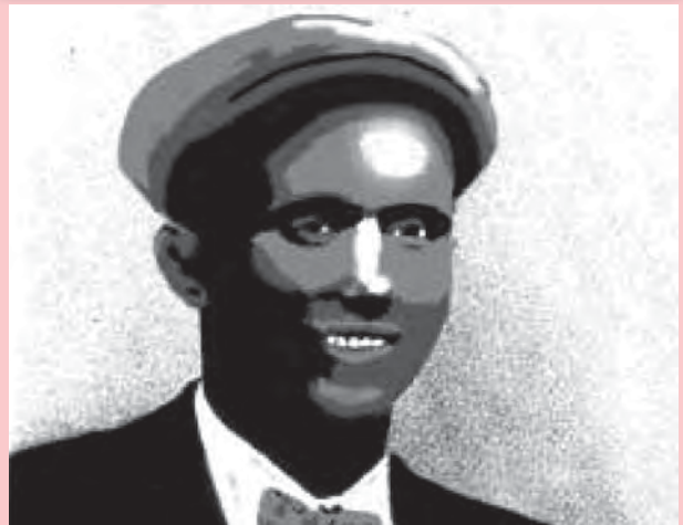
Gebre Hiwot Baykedagn