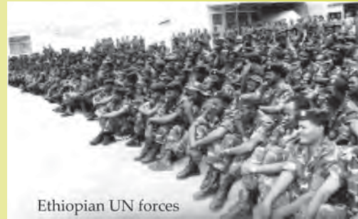
Ethiopian UN forces

Research and report on Ethiopia's role in peacekeeping missions in South Korea and Congo. Share your findings in the class for further discussion.