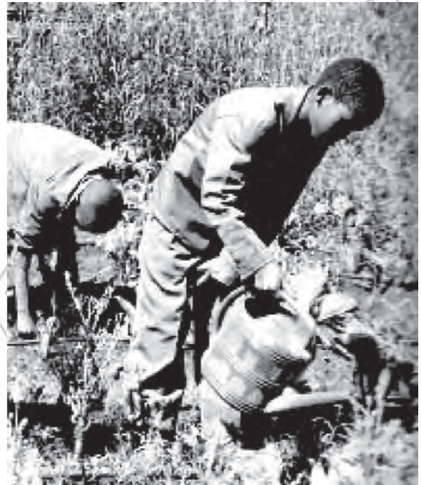
Two boys cleaning a compound

shouldering the burden will get angry. This may cause instability.