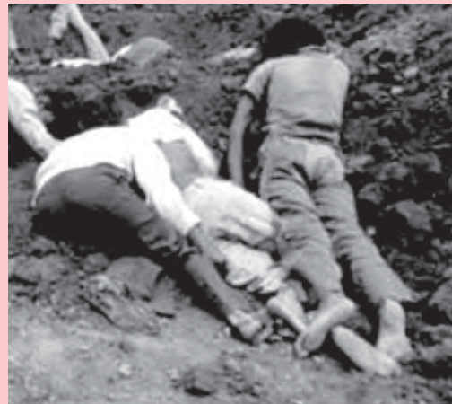
Red Terror victims

? Why should what happened during the Red Terror not be able to happen in Ethiopia today?