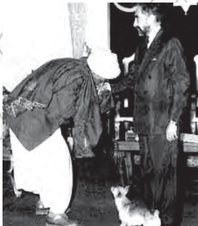
Emperor Haile Selassie I with one of his subjects