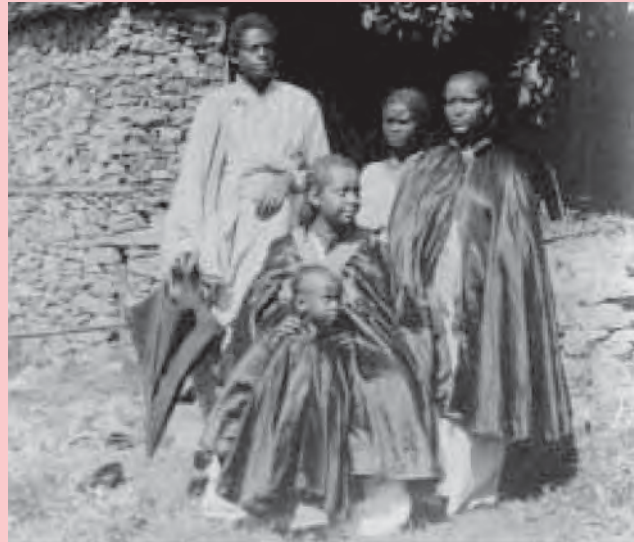
A landlord's family and tenant