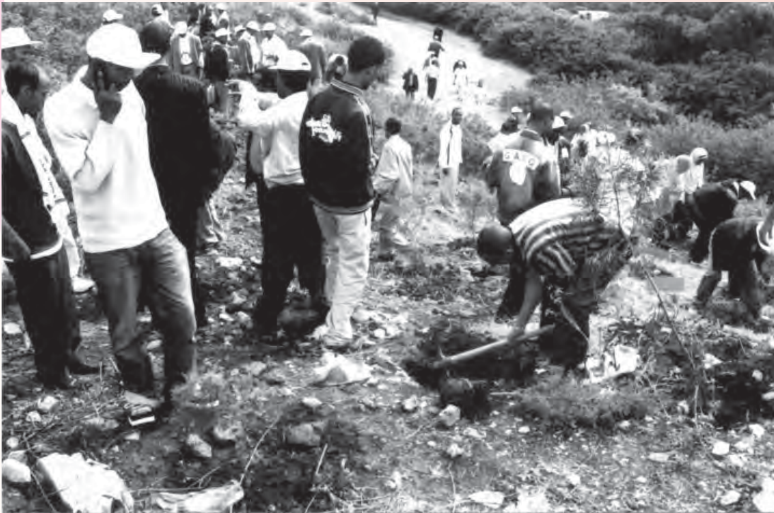
Citizens involved in community activities