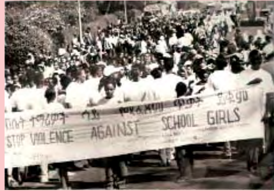
Demonstrations being staged

On the day, the demonstrators carried slogans that read 'Stop Female Genital Mutilation', 'Stop Early Marriage', 'Stop HIV/AIDS', 'Stop Rape' and 'Stop Domestic Violence on Women'. On their way to the demonstration venue, they were shouting loudly to attract lots of attention. When the demonstrators arrived at Meskel Square, more people joined them and it became a big demonstration. Members of the organizing committee made speeches. After the speeches, the committee head submitted the demands of the demonstrators to an official who was present there as a representative of the government. The official promised them that the government would give due attention to their demands.