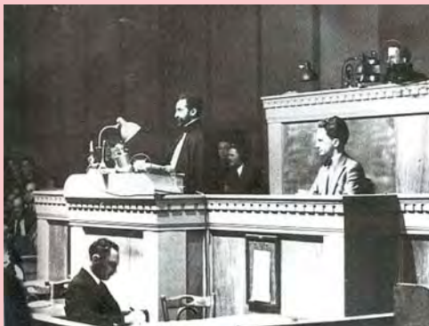
Emperor Haile Selassie at the League of Nations Conference in Geneva

its member state. Subsequently, its inability to deliver justice and stop this invasion showed its weaknesses and contributed to its collapse in 1939.