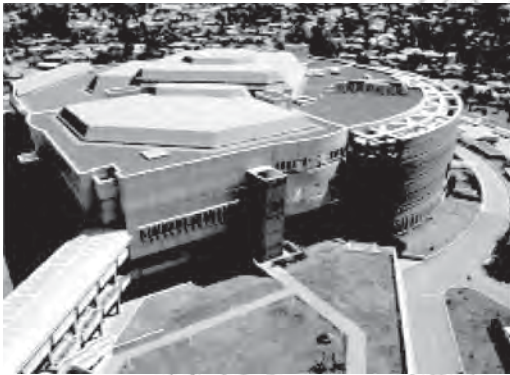
ECA Hall — Addis Ababa

In groups, discuss, examine and evaluate Ethiopia's roles in international relations. Group leaders should present their ideas to the class for further discussions.