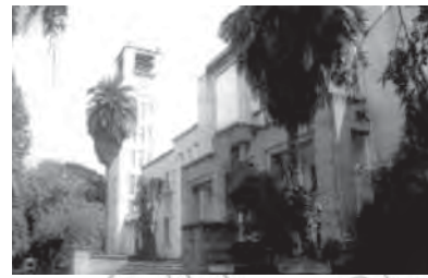
The House of Federation