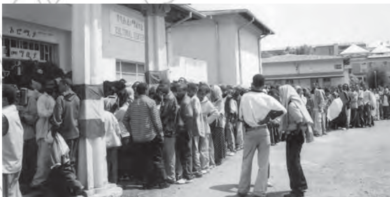
Waiting to vote in Ethiopian election