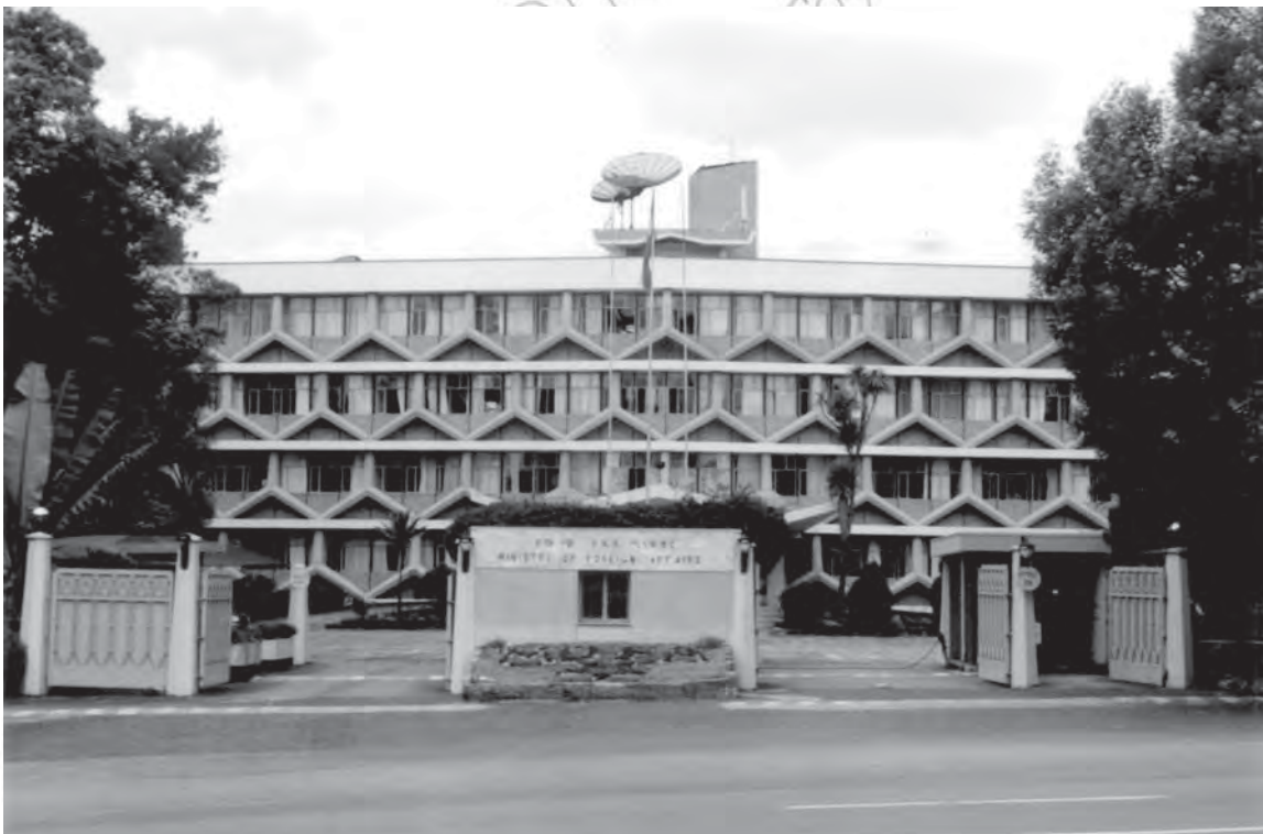
Foreign Ministry in Addis Ababa