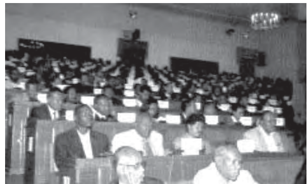
The work of government officials must be transparent

Another feature of a democratic system is the promotion of political tolerance. This can be realized when individuals are able to express their different viewpoints freely. Tolerance helps unify differences among ethnic, religious, linguistic and political groups.