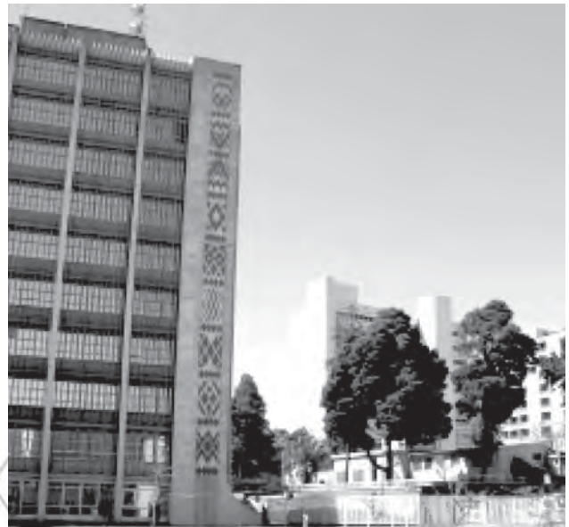
African Union buildings — Addis Ababa

Ethiopia has a long established tradition in foreign relations. At present, Addis Ababa is one of the diplomatic hubs of the world. It is home to the UN Economic Commission for Africa (ECA) and over one hundred diplomatic missions of governments. Ethiopia will continue to attract the attention of the world community of nations and peoples, to play a more constructive role in world politics in the years ahead.