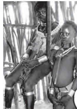
Hamar woman and child