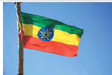
Respect for the national flag is one of our obligations

? Form groups to discuss and list some of the constitutional obligations you have. Also discuss why you have them and why you should execute them properly. Group leaders should present their ideas to the class for further discussion.