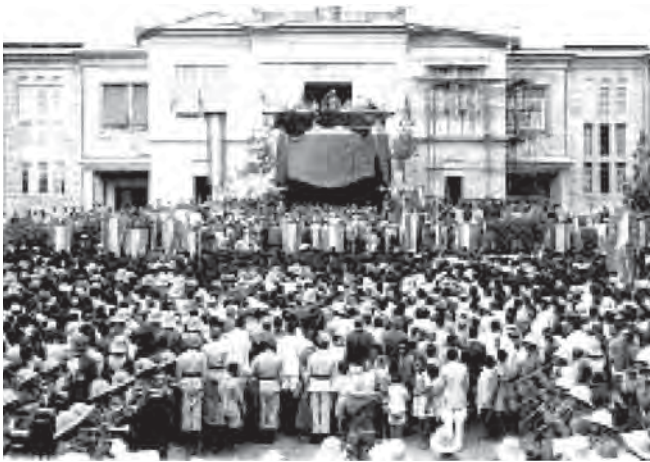
Emperor Haile Selassie I addressing parliament

In the following readings, you will see some important points on how a constitution is formulated and ratified in Ethiopia.