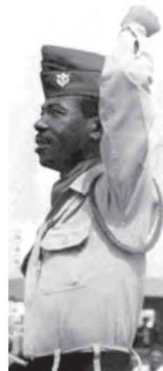
Colonel Mengistu Haile Mariam, the embodiment of a dictatorship

? Discuss the characteristics of the 1987 Derg Constitution in a group. Present the summary of your discussion to the class.