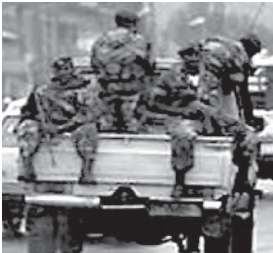
National army working for the rule of law

International law includes those customary and treaty (convention) rules which are considered legally binding by states in their relation to each other. It may be defined as the body of general principles and specific rules which the members of the international community consider binding upon them in their mutual relations. The UN Universal Declaration of Human Rights of 1948 gave rise to a number of international agreements and conventions. These agreements and conventions govern relationships between countries.