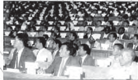
House of People's Representatives, the embodiment of the will of the people

? List some of the basic differences of the 1987 Constitution, and the 1995 FDRE Constitution. Discuss in a group and let each group present one of the Constitution's basic concepts, then discuss as a class.