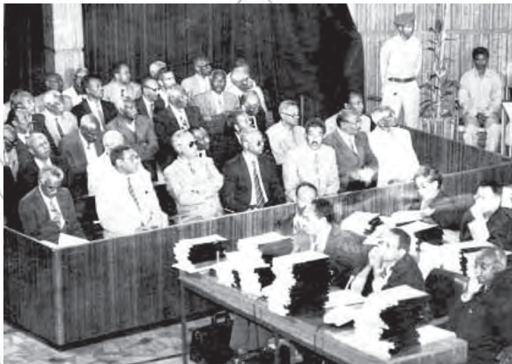
Members of the Derg government brought to trial for their violation of rule of law