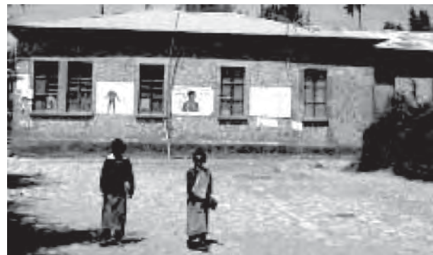
Education is important for rule of law to be effective

? What is the difference between rule of law and absence of rule of law? Discuss as a class.