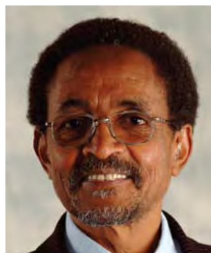
Figure 1.3 Dr Tewolde Berhan Gebre Egziabher

Around 300 million people are affected by schistosomiasis in the tropical and sub-tropical parts of the world – so the work of Aklilu Lemma could make an enormous difference in many other countries as well as Ethiopia. Dr Aklilu recognised this when he said “we found a poor man’s medicine for a poor man’s disease”.