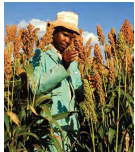
Figure 1.11 An agronomist examining sorghum crop

Farming is vital to Ethiopia. About 90% of our exports and around 80% of our economy depends on agriculture.