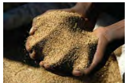
Figure 1.12 Scientists have improved crop production of Quncho, an improved teff. It is a hybrid crop now yielding more than 30 quintals per hectare.