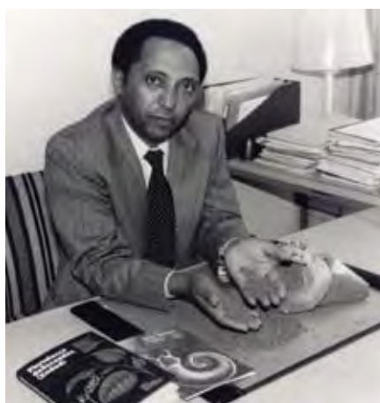
Figure 1.2 Dr Aklilu Lemma, one of Ethiopia's most renowned biologists, with the snail-killing soapberries known locally as Endod

genetic engineering the deliberate, controlled manipulation of the genes in an organism, with the intent of making that organism better