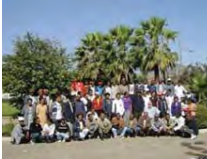
Figure 1.9 The AHRI buildings and some of the workers who work there