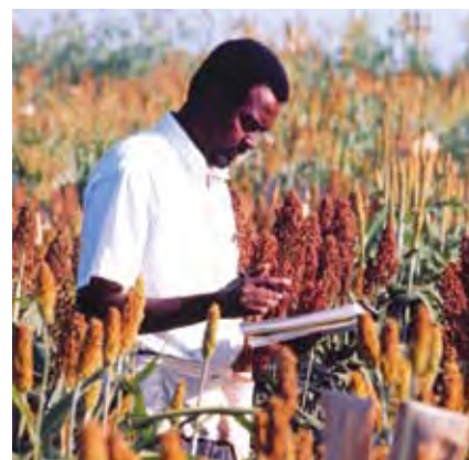
Figure 1.7 Dr Gebissa Ejeta who has been honoured for his work in developing new, high yielding strains of sorghum which grow well in our conditions