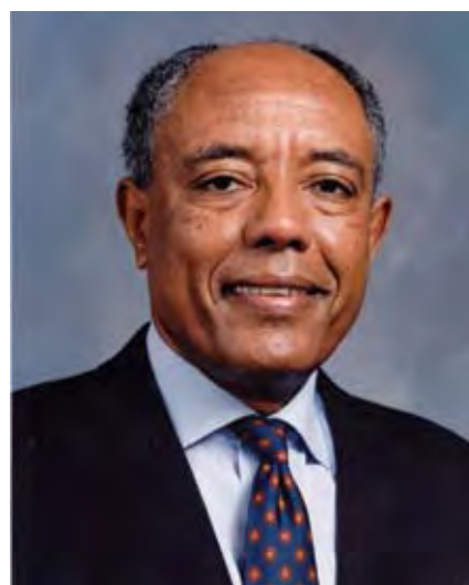
Figure 1.4 Professor Tilahun Yilma