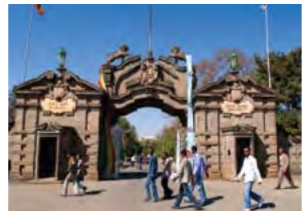
Figure 1.8 Addis Ababa University is home to much internationally recognised research.

Addis Ababa University is not the only renowned university in Ethiopia. There are many others, including Haramaya University, Mekelle University, Jimma University, Hawassa University, Gonder University and Bahir Dar University. They all have active biology departments where teaching and research takes place.