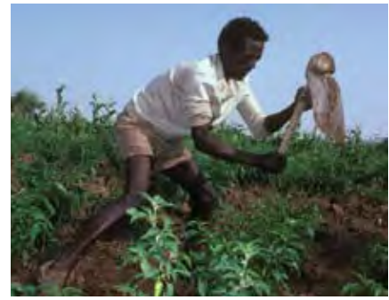
Figure 1.10 Farming is vital to Ethiopia. Biologists with the EIAR work hard to improve our crops, our animals and our soil.

Current research in the IBC looks at many areas including forest and aquatic plants, medicinal plants, animal genetic resources, biotechnology and safety, and ecosystem conservation. The institute also holds one of the leading gene banks in the whole of Africa with over 300 plant species represented.