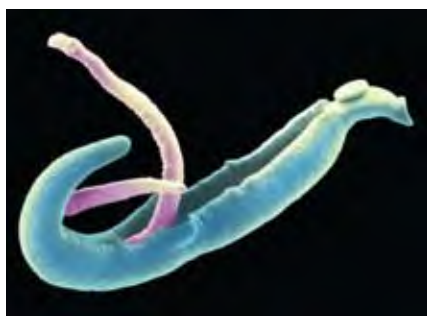
Figure 1.1 Highly magnified image of the parasitic flatworms that cause schistosomiasis